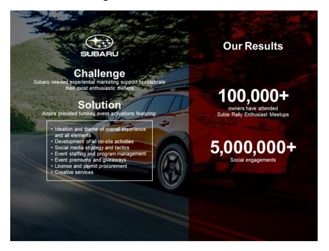
Figure 4. Enthusiastic Owners

The campaign results included activating over 100 thousand Subaru owners who attended "Subie Rally Enthusiast Meetups," and more than 5 million social engagements.