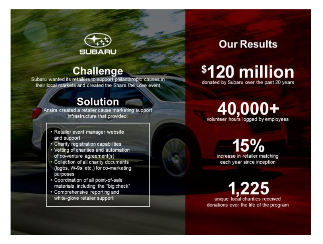
Figure 3. Philanthropic Support