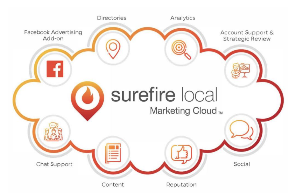
Figure 7. Surefire Local's Marketing Cloud

Surefire Local provide a marketing cloud platform solution to provide an effective digital marketing strategy for its clients that integrate multiple touchpoints, as Figure 7 illustrates.